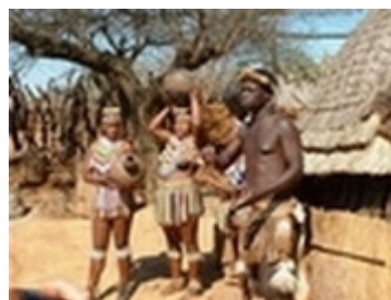
Zulu Village (click on pic for full size)