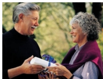
Retired in South Africa (click on pic for your retirement info)